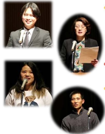
↑ Speech at Lounge Festival last year

It's a festival for foreign residents and Japanese people to exchange and communicate with each other. Foreign residents in Yokohama will speech in Japanese. We're waiting for you to join us: people who just recently came to live Japan or have been living in Japan for a long time, people who want to know more about Japan or tell other people more about your mother countries, and etc. It'll be OK even if you cannot speak in Japanese or cannot understand Japanese. We have foreigner staffs and volunteers who teach Japanese to help you. We're making plans for all the participants to enjoy. Come and enjoy it please.