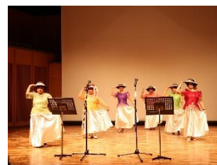
↑ Scene of the past event.

Free of charge. Free entry and exit, welcome to Lounge Festival!